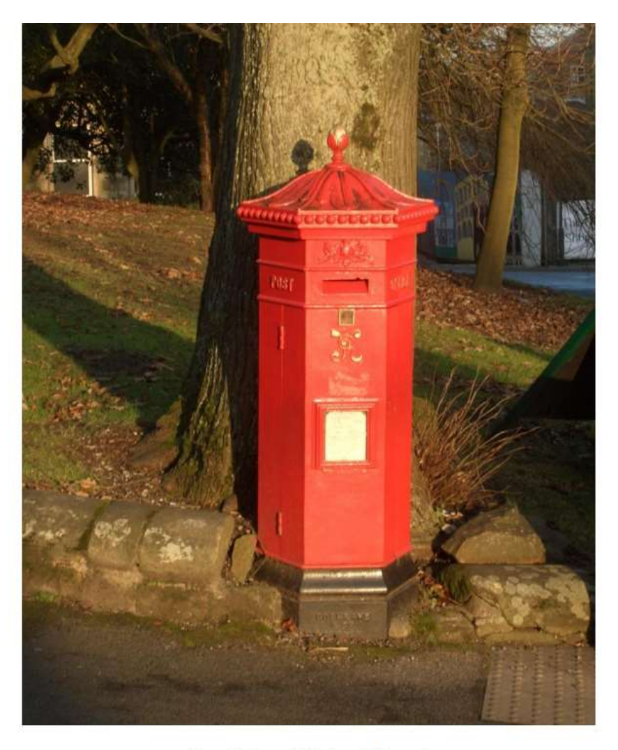
Post Box, Water Street C1879, Hexagonal Penfold design.