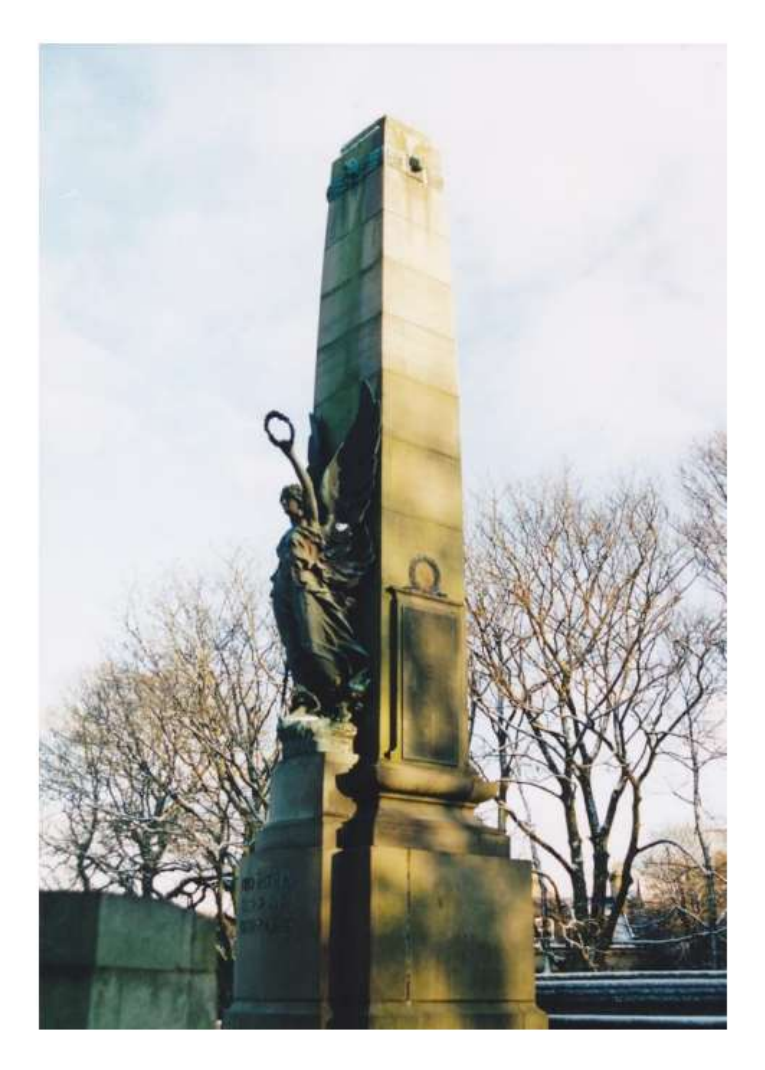
War Memorial - The Slopes 1920