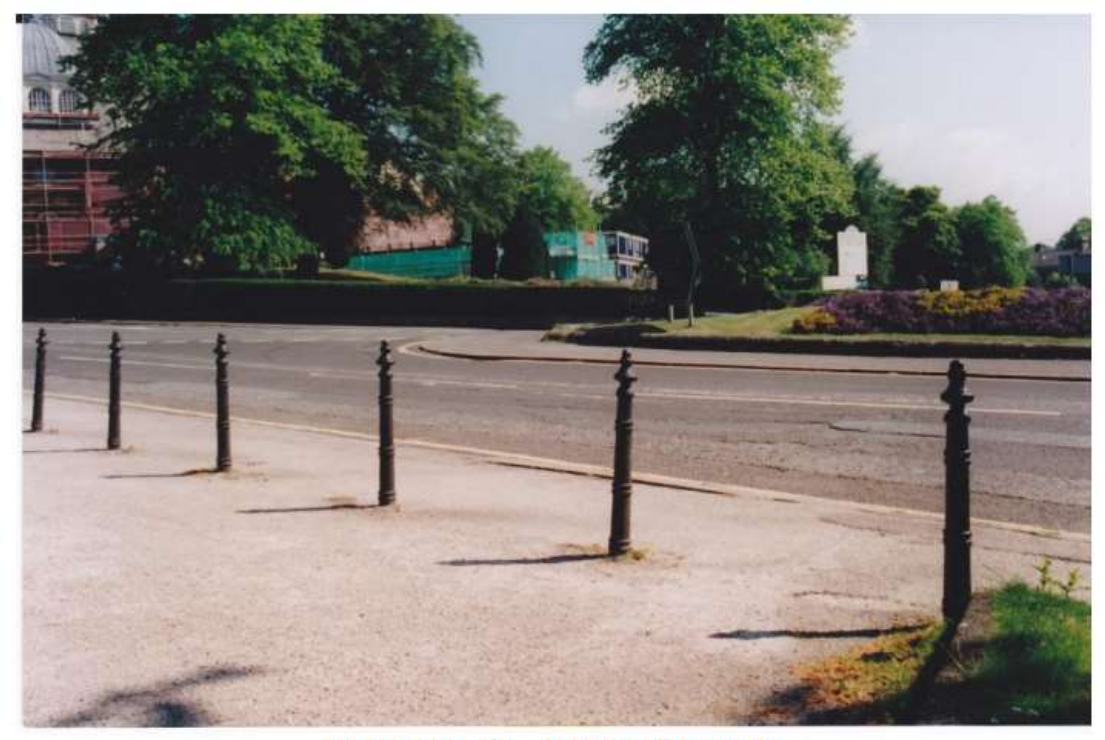
Bollards, St. John's Church Six cast iron bollards to the east of the church.